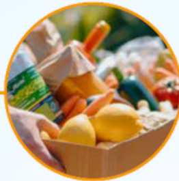
NUTRITION AND FOOD SUPPORT