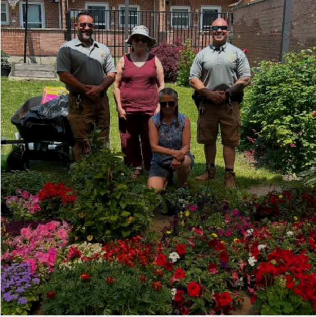
ERIE COUNTY SHERIFF'S OFFICE