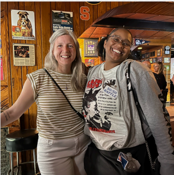
MISTER GOODBAR NIGHT THANK YOU MR. GOODBAR STAFF AND THE MOON OWLS!