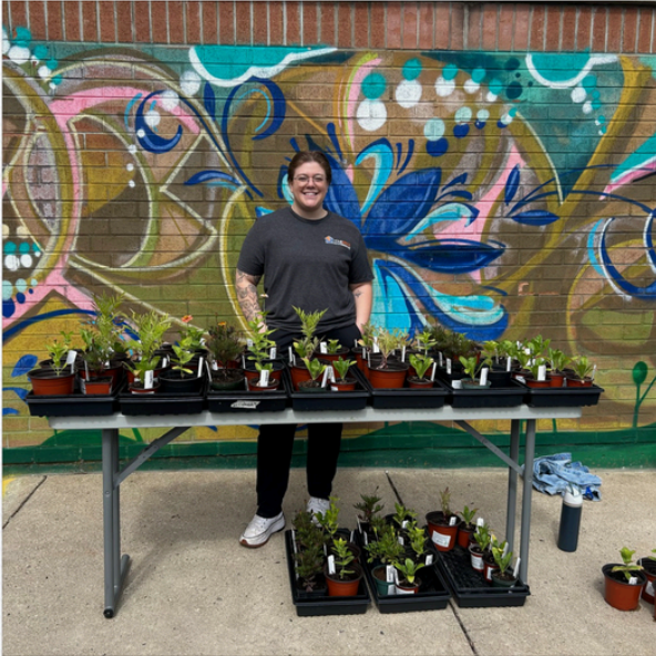
PLANT SALE THANK YOU GRASSROOTS GARDENS!