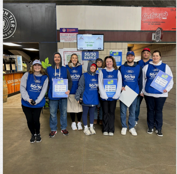
BISONS GAMES THANK YOU 50/50 VOLUNTEERS!