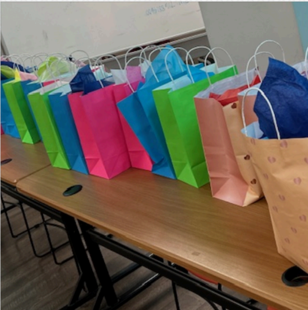
DASH'S + LUSH