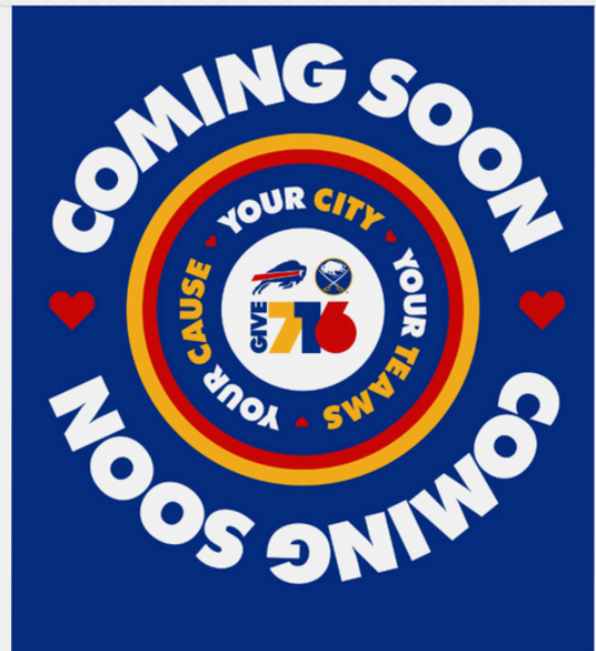
AND COMING LATER THIS MONTH... GIVE 716